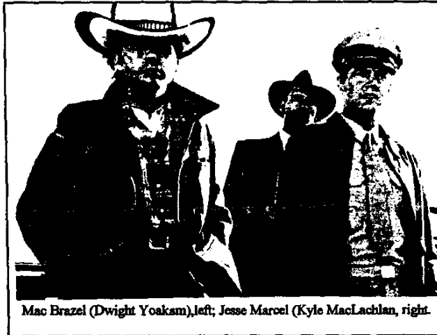
Mac Brazel (Dwight Yoakam), left; Jesse Marcel (Kyle MacLachlan, right.

"What was the story that led to the military announcing that they had a flying saucer... what led to them denying that they had one... why did so many military people who were involved keep their silence on this for the better part of their lives... and why did so many begin to speak out later?"